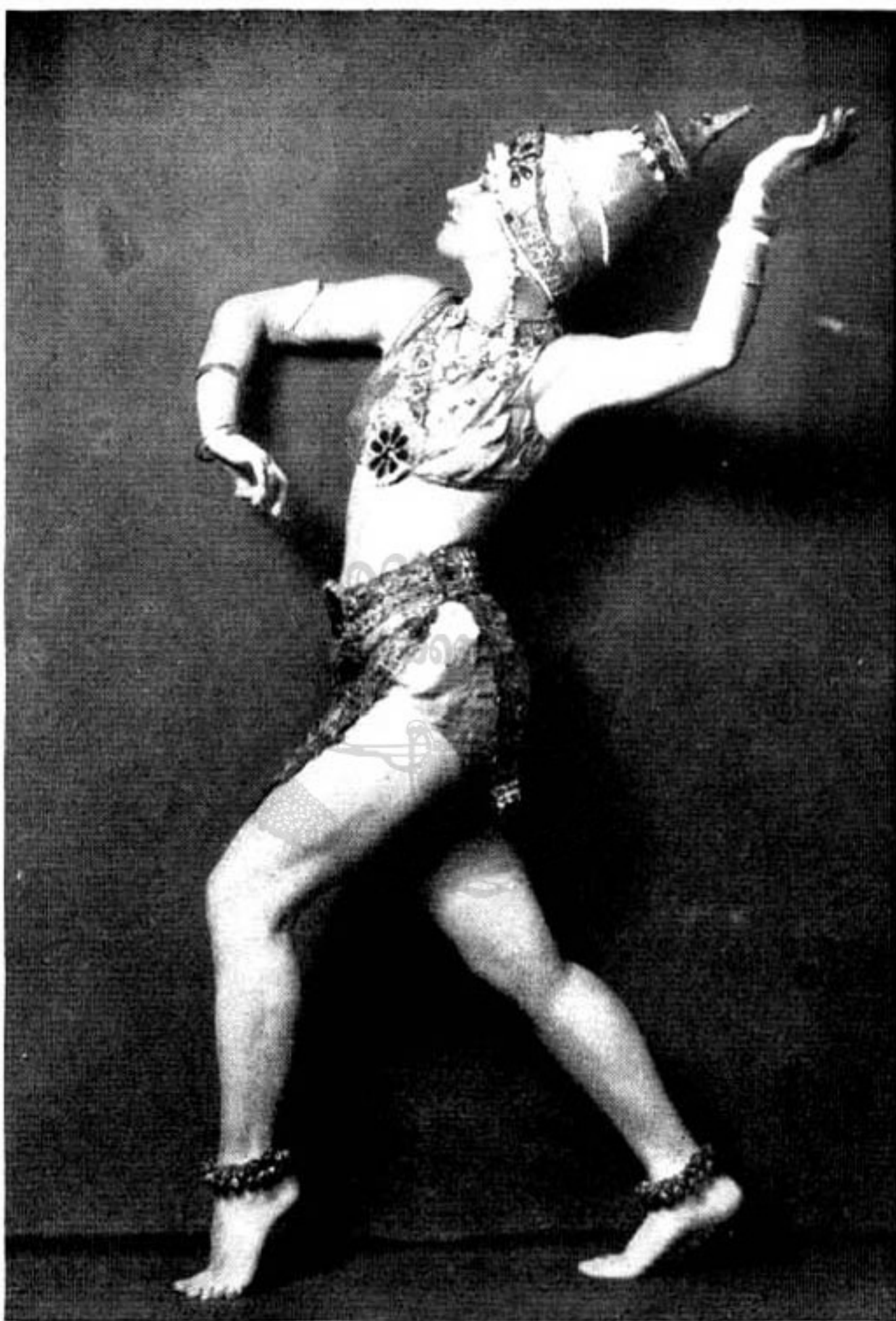
Vir — The Heroic Mood